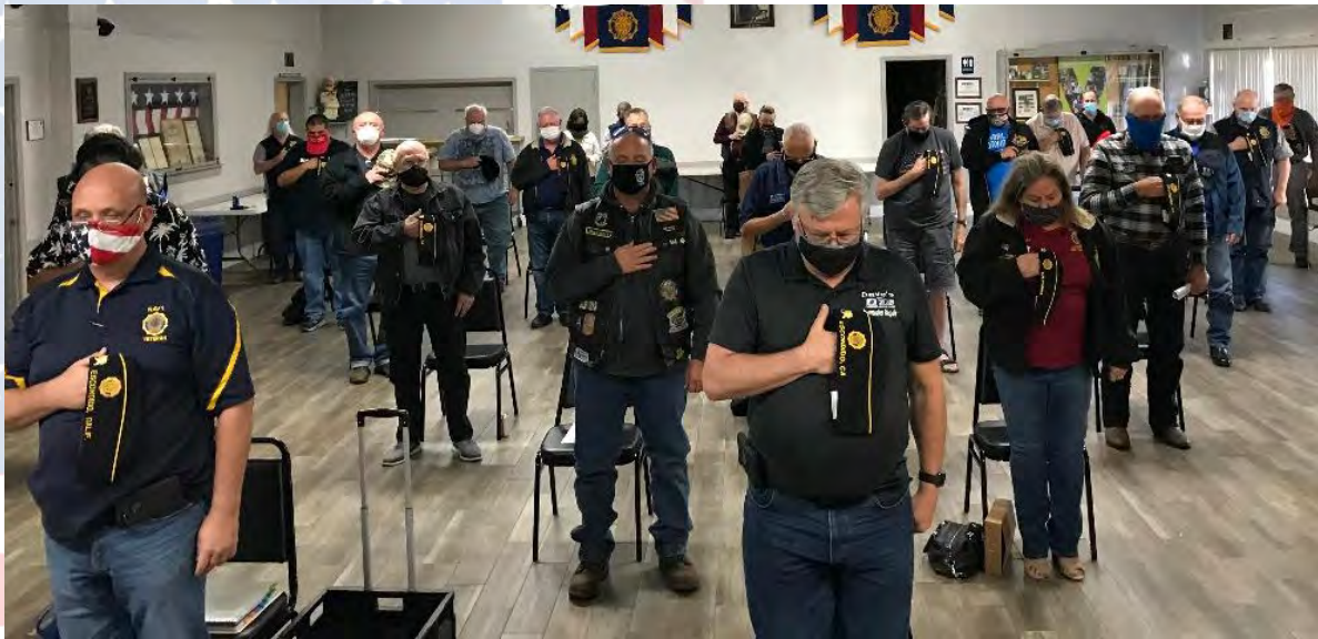
MAY POST MEETING _membership during the Chaplain's opening prayer.